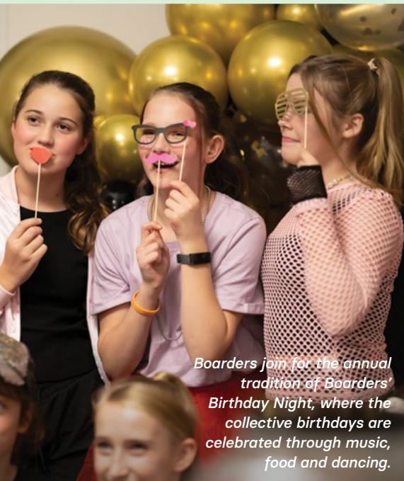
Boarders join for the annual tradition of Boarders' Birthday Night, where the collective birthdays are celebrated through music, food and dancing.

Outside of organised activities, students can also walk down Glenferrie Road after school, visit the city, see day College friends on weekends or simply relax in the Boarding House.