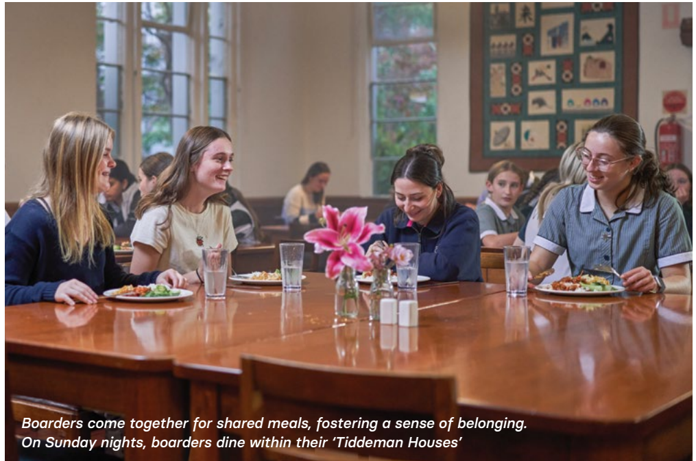
Boarders come together for shared meals, fostering a sense of belonging. On Sunday nights, boarders dine within their 'Tiddeman Houses'

From academic support, scheduled Prep time and subject tutoring, through to extensive wellbeing support from the Boarding House and the College, Tiddeman House is an extraordinary place for boarding students to learn, live and discover their true interests and passions.