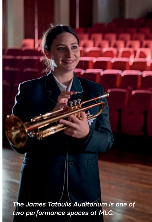
The James Tatoulis Auditorium is one of two performance spaces at MLC.