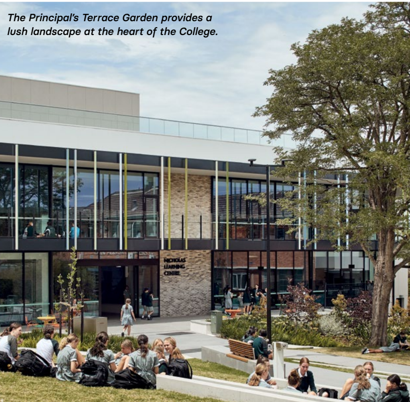
The Principal's Terrace Garden provides a lush landscape at the heart of the College.