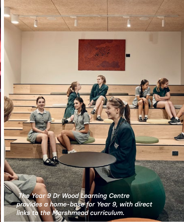
The Year 9 Dr Wood Learning Centre provides a home-base for Year 9, with direct links to the Marshmead curriculum.