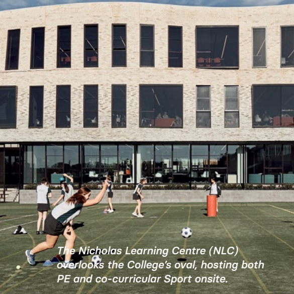
The Nicholas Learning Centre (NLC) overlooks the College's oval, hosting both PE and co-curricular Sport onsite.